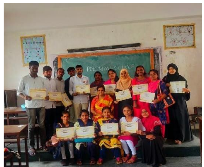
PHOTO'S OF CLASS AND VALEDICTORY CEREMONY