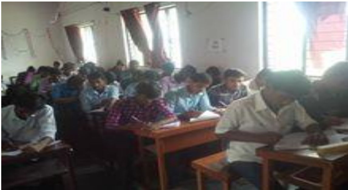
Placement Cell: Unnati Orientation Function